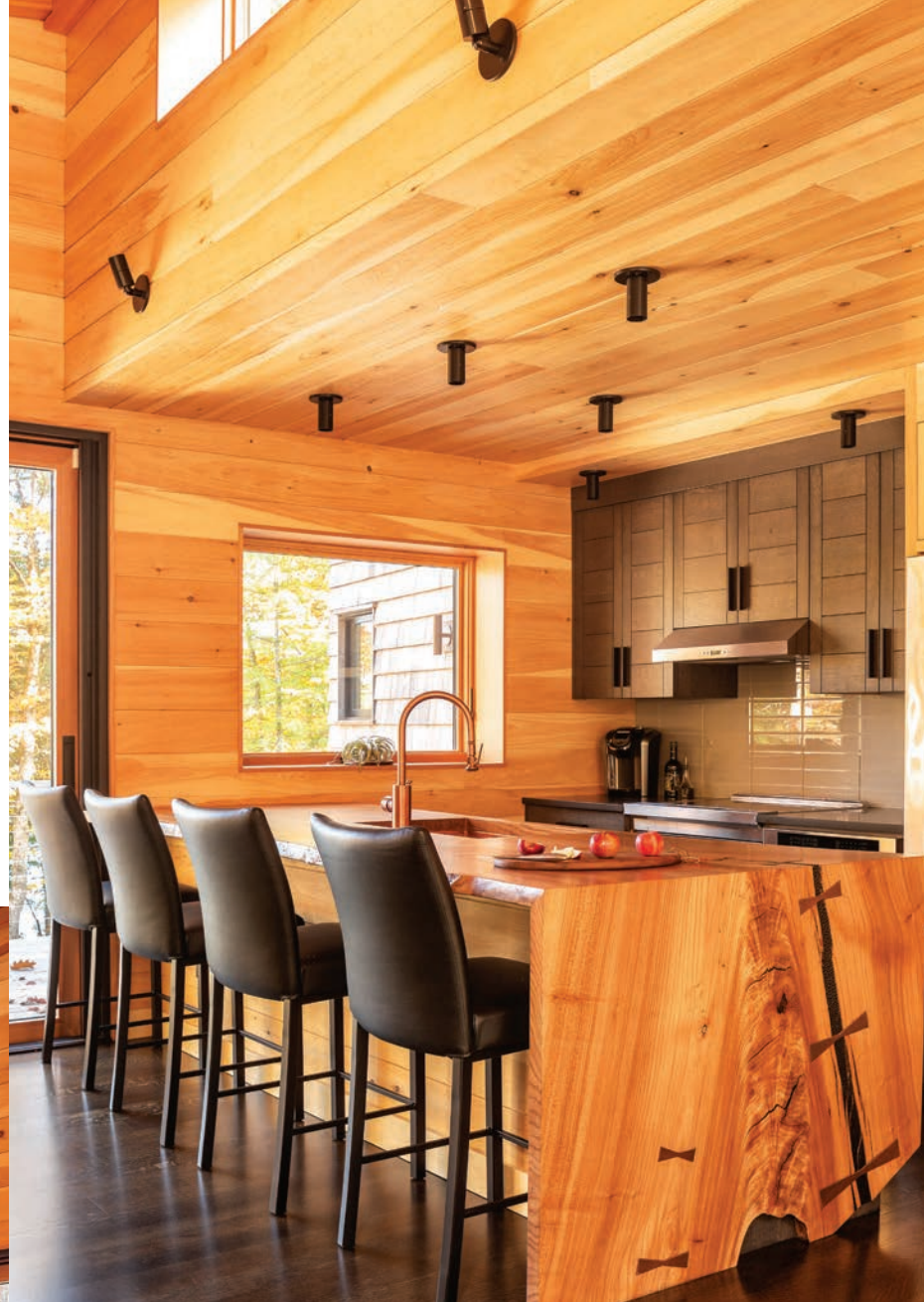
left Upstairs kitchen with custom cabinetry and island by Robie Wentworth. below, left Round Pond in autumn. below, right Porches run the length of the great rooms. At the far end of the house, a screened porch sits over a shed for lake gear. The shed was incorporated into the house because permitting allowed only one structure on the property. opposite, top A detail of the living room showing pine walls and the edge of a custom sideboard whose white oak drawers are stained the same custom blue-black used on kitchen cabinetry and elsewhere in the house. opposite, bottom The wood's warmth made black a natural contrast for the furnishings. Robie Wentworth made the dining room table with a live edge.